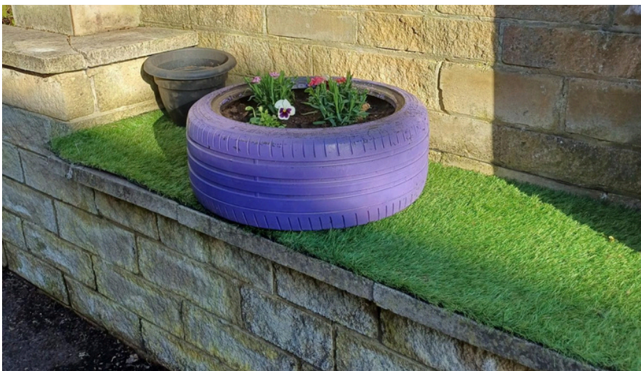
Photos: Transformation of the HACS 4 Men garden by the residents following the greenhouse construction.