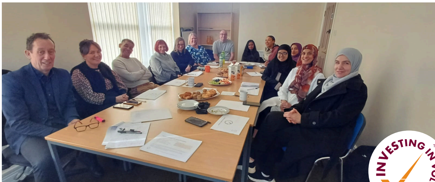
Photo: liV workshop at Edmund Street.

YOUR SPRING VOLUNTEER AND DONATIONS NEWSLETTER