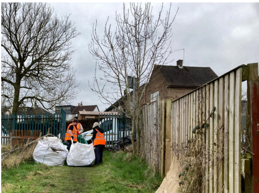
Photos: Equans volunteers clearing up Fairmount's allotment.