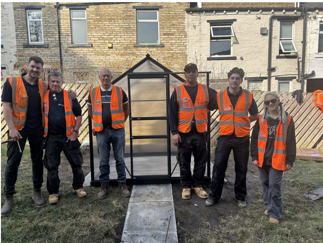
Photo: Equans volunteers with the greenhouse they built at HACS 4 Men.

Equans is a provider of technical services, facilities management, regeneration and energy services. Workers from the company are in the process of carrying out internal wall insulation work on 22 of our properties under Chartford Housing (the property and development arm of Horton Housing). This is part of an objective to help improve the energy efficiency of 30 of our properties, an objective given as part of the Social Housing Decarbonisation Fund to Chartford Housing.