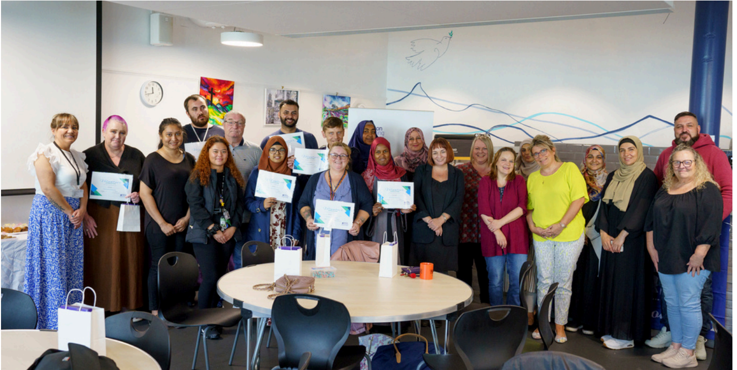
Photo: Volunteers and colleagues at the volunteer celebration event.

YOUR AUTUMN VOLUNTEER AND DONATIONS NEWSLETTER